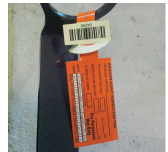
ANCHOR LABEL ATTACHMENT