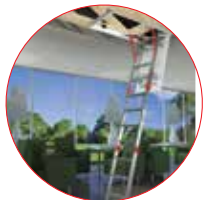
SUITS ALL CEILING TYPES UP TO 4300MM