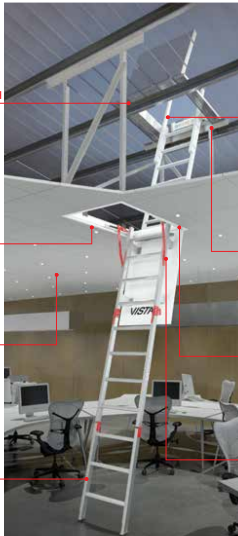
RETRACTABLE STILES FOR SAFE ACCESS THROUGH ROOF HATCH