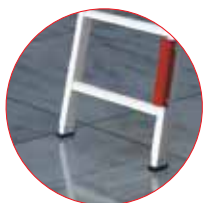
ADJUSTABLE FEET INSERTS TO SUIT FLOOR LEVEL