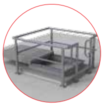
INDUSTRIAL RATED SKYDORE ROOF HATCH