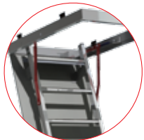
STURDY HIGH STRENGTH ALUMINIUM CONSTRUCTION